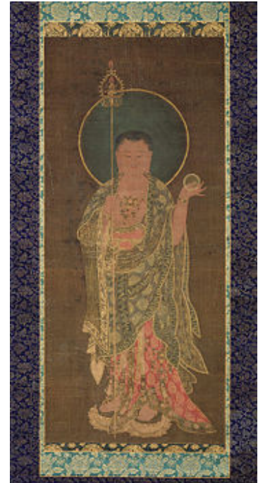
1.3.3 Kṣiti,garbha scroll, Koryo (Korean), late 14 th cent

1.3.3.2 DÌZÀNG’S ORIGIN AND APPEARANCE. Dizàng’s depiction as a monk is traditionally said to be on account of Kim Kiaokak (Kor: Kim Gio Gak, Jīn Qiáojué 金喬覺), a prince of Silla (the southernmost of the three kingdoms of ancient Korea) who became a monk under the name of Chijang (Korean, Jijang ), the Korean equivalent of Dizàng 地藏. He arrived in China in 653 and died in 728 at the age of 99, after residing at Jiùhuā shān 九華山 (Nine-Glory Mountain), 83 for 75 years. His uncorrupted body is said to have been gilded over and became an object of worship.