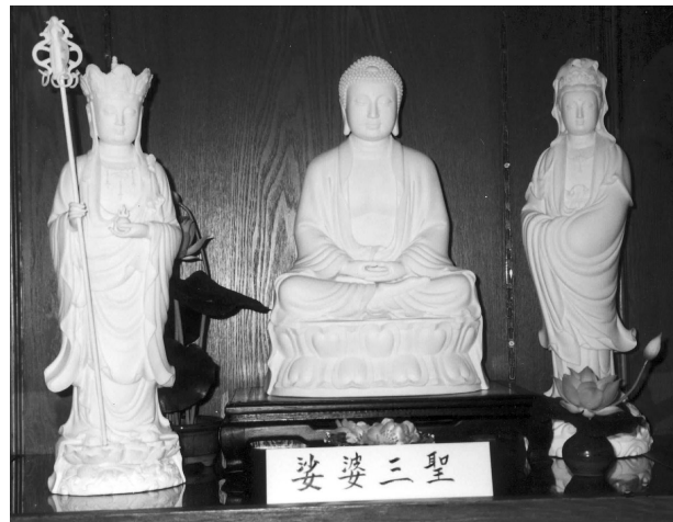
1.3.1 The Saha Triad ( suōpó sānshèng 娑婆三聖): Shakyamuni Buddha flanked by Dizàng (l) and Guānyīn (r). (Buddhist merchandise store, Yungang, in the Hong Lim Complex, South Bridge Road, Singapore.)

The Chinese Buddhists inherited the Mahāyāna conception of the bodhi, sattva (Skt) or pūtisàduō 菩提薩埵 (or pūsà 菩薩, for short), that is, a being who is the “essence” ( sattva ) of “awakening” ( bodhi ),